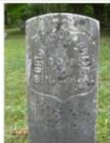
ORLANDO PRIDE CO. C 8 N.Y. H.A.