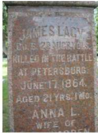
JAMES LACY CO. B 2 D MICH. VOLS. KILLED IN THE BATTLE AT PETERSBURG JUNE 17, 1864 AGED 21 YRS. 1 MO.