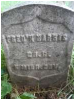
FRED'K HARRIS CO. B 5 MICH CAV. Aged 43 Yrs.