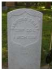
SANFORD SKUTT CORP. CO. L 1 MICH E & M 1834 1919