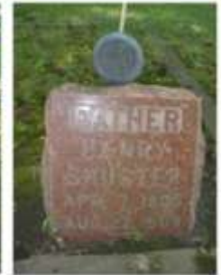
SHUSTER FATHER HENRY SHUSTER APR. 7, 1833 APR. 7, 1909