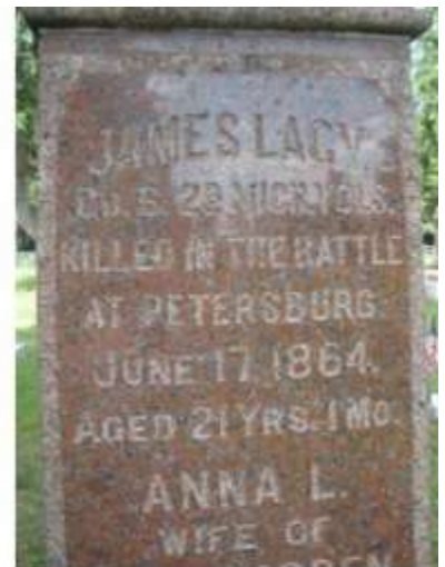
JAMES LACY CO. B 20 MICH. VOLS. KILLED IN THE BATTLE AT PETERSBURG JUNE 17, 1864 AGED 21 YRS. 1 MO.