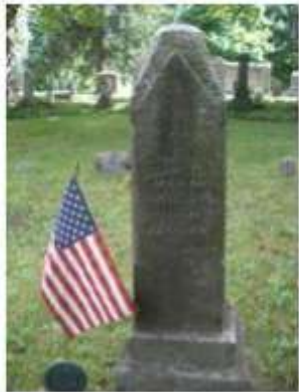
THOMAS RUTLEDGE DIED MAY 10, 1884 Aged 42 Yrs. (illegible)