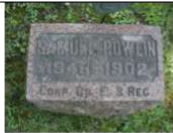
SAMUEL ROWLIN 1846—1902 CORP. CO. E 3 REG.