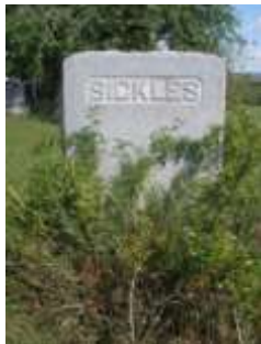
Headstone located at Antietam Nat'l Cemetery—Maryland