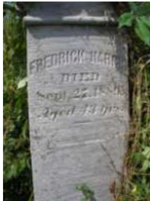
FREDRICK HARRIS Died Sept. 27, 1889