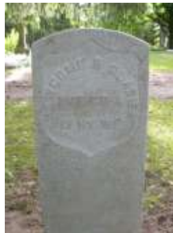
NEWCOMB B. GLAISER* PVT. CO. A 17 N.Y. INF.

*name at enlistment; family name is "Glaizer"